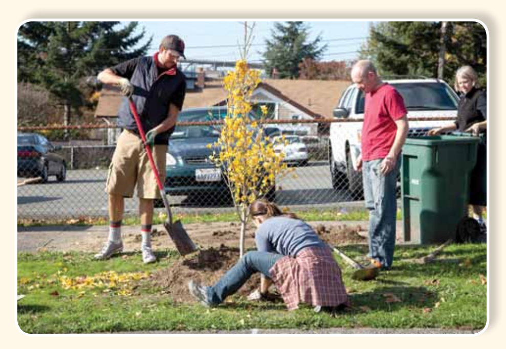
Trees provide critical functions in urban areas as integral components of ecosystem functions, as a natural alternative for stormwater regulation, and for improving urban aesthetics and livability.