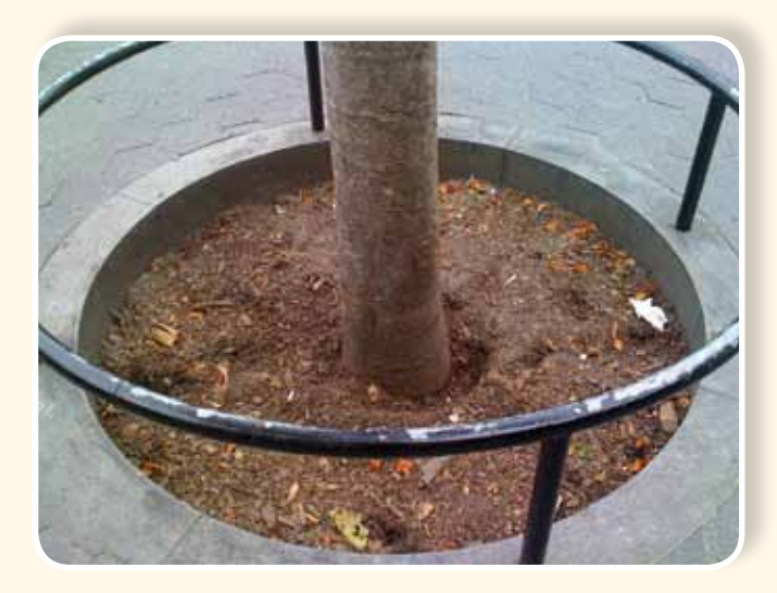
Street trees are often planted into rectangular or circular cutouts bordered by concrete.

Street trees are often planted into rectangular or circular cutouts bordered by concrete. The vast majority of tree roots are contained in these pavement cutouts because surrounding soils are highly compacted for road and sidewalk construction. To assure that no roots escape, tree planting pits may even be lined with concrete. The available soil in these pavement cutouts is highly disturbed, too shallow (Jim, 1998a, 1998b), and contains residuals from surrounding construction such as stones, concrete, and other materi-