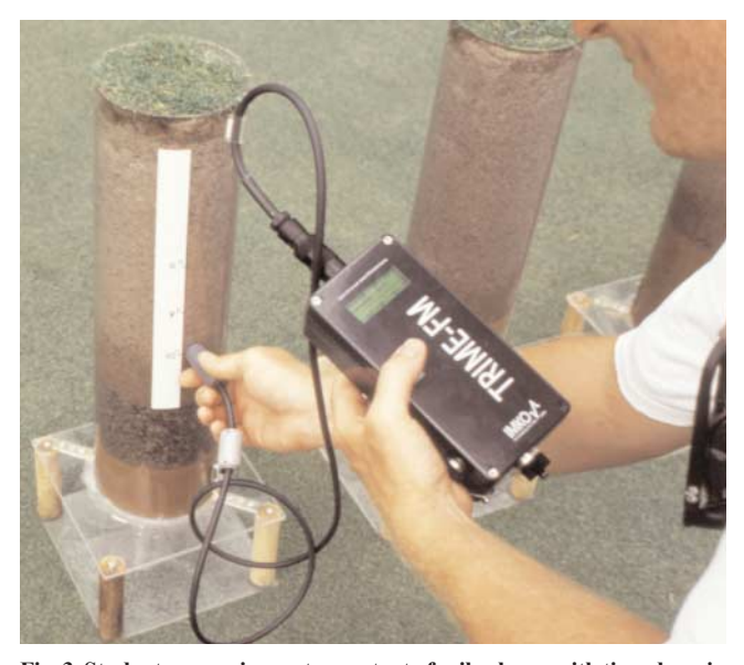
Fig. 3. Student measuring water content of soil column with time domain reflectometry (TDR) probe.